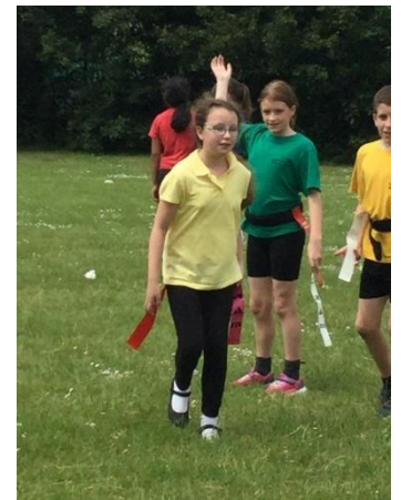
Bournemouth Rugby team spent 4 weeks coaching us in how to play tag rugby during our PE lessons.