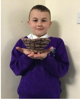
The children tried their hand at pottery in our Ancient Greek unit.