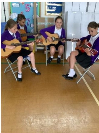
We learnt how to play folk instruments when the band 'Wren' visited. We performed sea shanties in our class band.