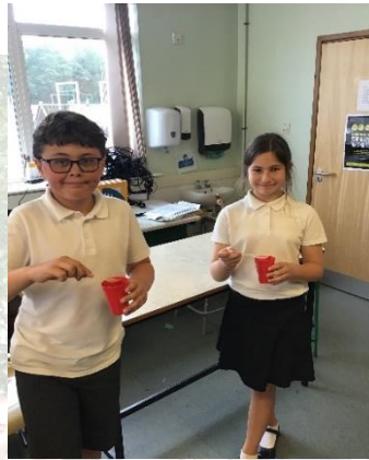
We became master chefs during our food technology unit.