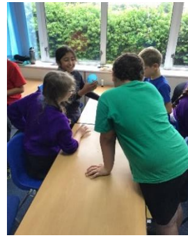
We learned all about reversible and irreversible changes in Science.