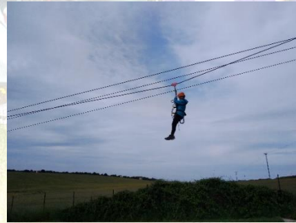
Year 6 thoroughly enjoyed their residential visit to Osmington Bay. Their behaviour and attitude toward new challenges and experiences were outstanding and we are very proud of them!